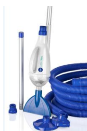
Limpiafondos automático Automatic cleaner 08011A