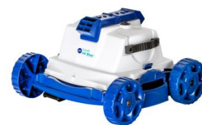
Robot Robot RKJ14